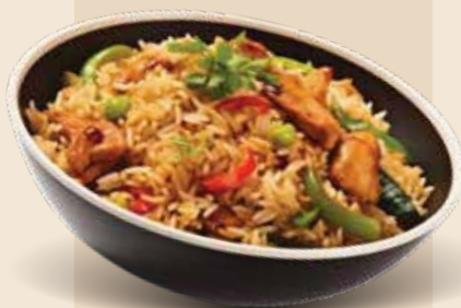
CHICKEN FRIED RICE